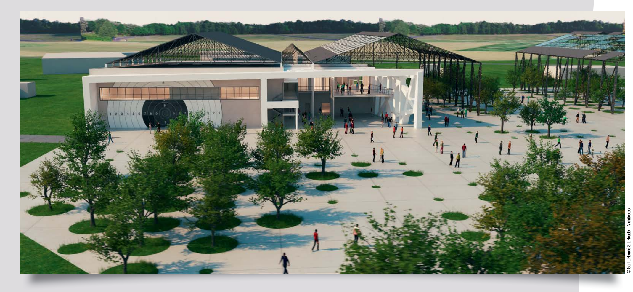
Final Hall view and multipurpose aera (expositions...)