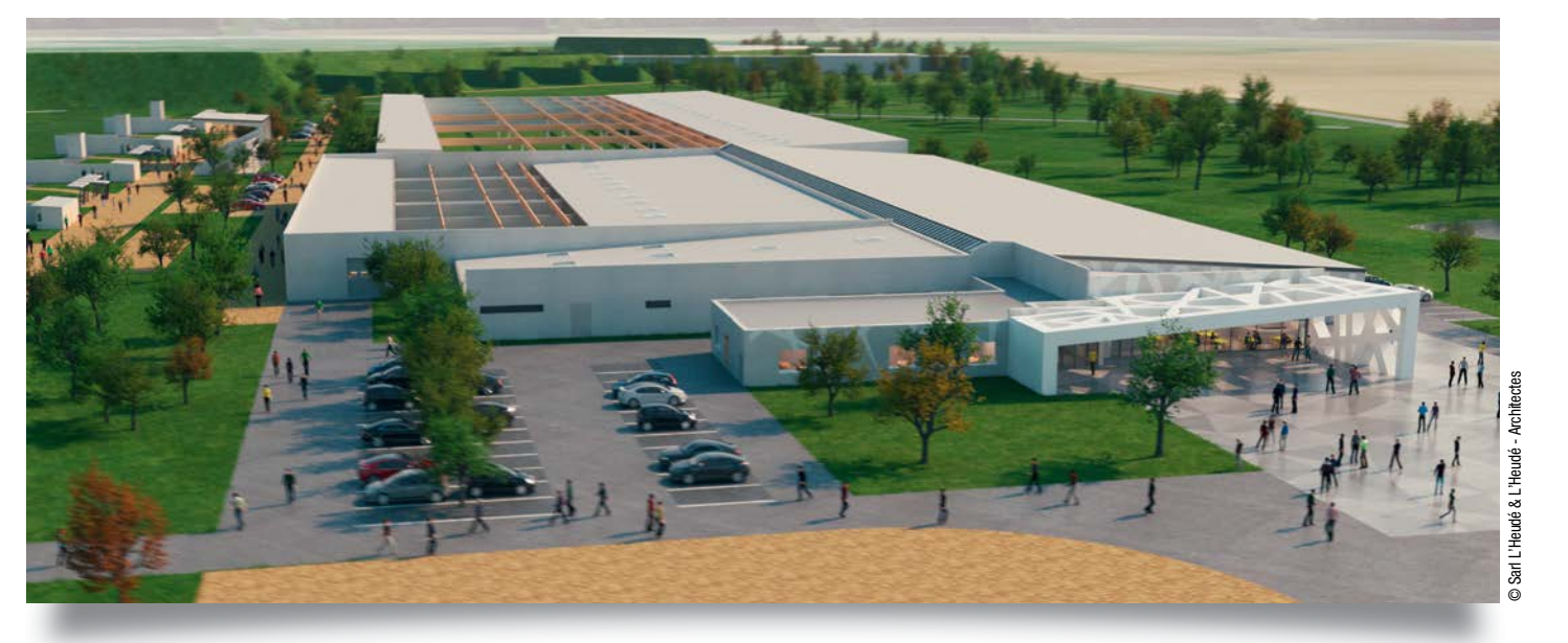
View of the 10, 25, 50 m shooting ranges

■ An ambitious national and international shooting sport center 05 ■ 140 000 sq/m of shooting ranges over a 800 000 sq/m resort 07 ■ Shooting sport, a booming discipline in France 09 ■ The French Shooting Sport Federation, a dynamic olympic federation 11 ■ Disciplines practiced within the French Shooting Sport Federation 13